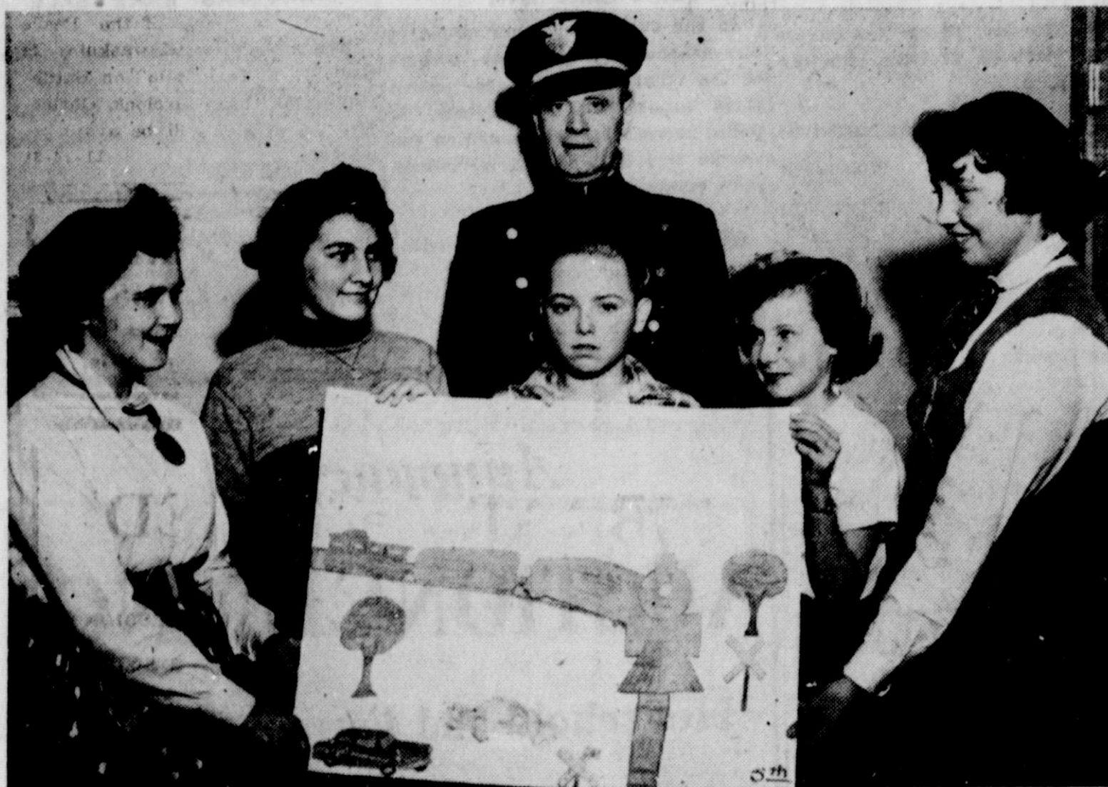
The five winners of theatre tickets in the recent Kewaskum Safe Driving Day poster contest are shown above with Chief of Police