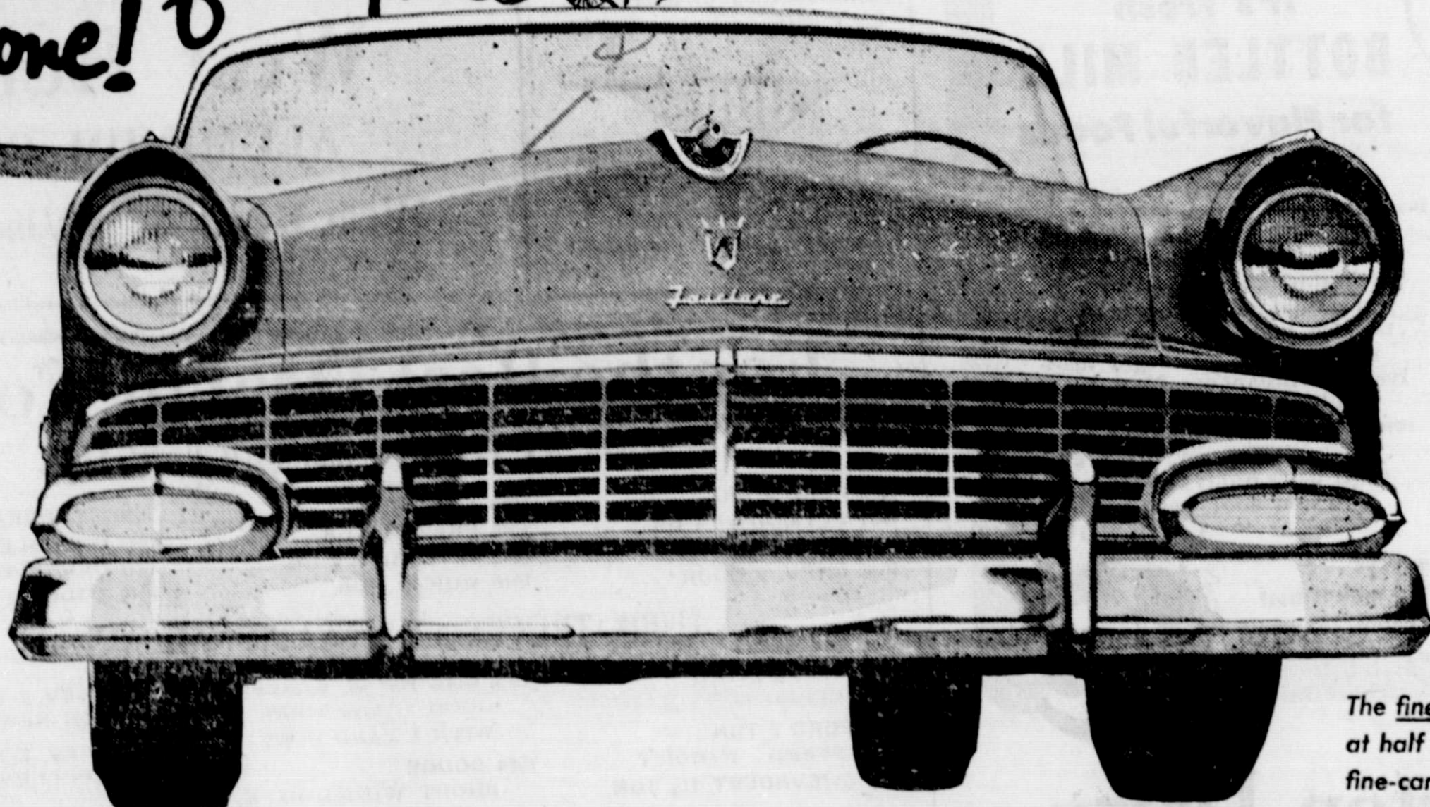
The fine car at half the fine-car price

Many love Ford for the beauty of its new Thunderbird styling or the matchless "git" of its new Thunderbird-like Y-8 power—or the added safety of its new Lifeguard Design. But the main reason why Ford has won first place in the hearts of so many is because it gives you all the fine-car features at such a dollar-and-sense price.