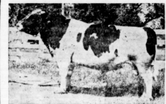
WEIX WOODVILLE ROAMER KING Our Holstein H-29

FOR Northwestern Rendering Co. North Lake, Wis.