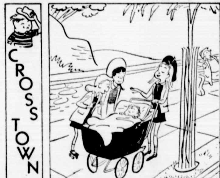
"She doesn't exactly pay me in money but she lets me use up her old nail polish."