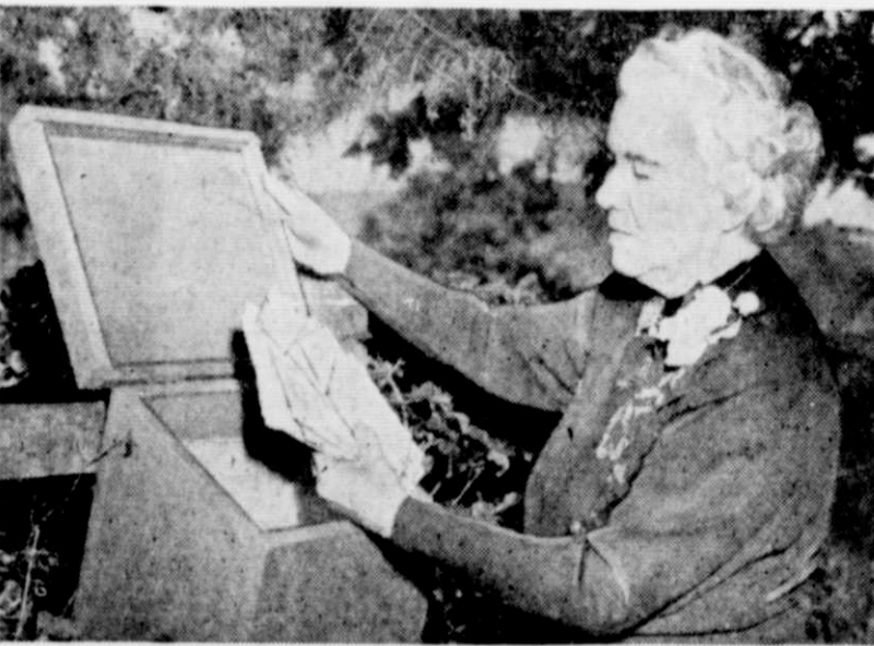
SISTER KENNY INCURABLY ILL . . . Sister Kenny, Australian nurse who became leading crusader in war against polio, declared recently that she is incurably ill and "has little time left in this world." Still, she went ahead with plans to attend international polio conference in Copenhagen. She receives mail in Australia from all over the world.