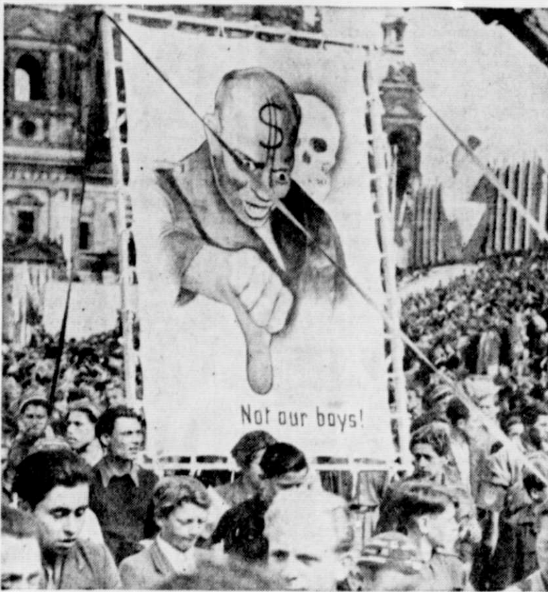
RED PROPAGANDA . . . The famous "thumbs down" picture of General Dwight D. Eisenhower was made in Copenhagen last January during a tour of military installations. Recently, the Reds of east Berlin caricatured it, adding the dollar sign and a grinning skull and carried the picture in a parade. The Reds have interpreted the picture as they chose, indicating that General Eisenhower turned thumbs down on using American youth in the armies of Europe.