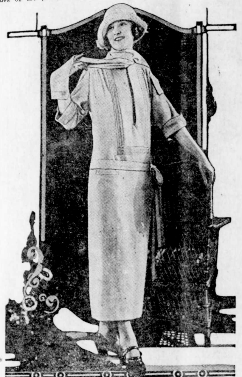
Day-Frock Adapted to Various Fabrics.

Nearly all day-frocks are cut on the lines of the pretty model pictured, and adaptable coats for general wear, which the spring season brought in such variety of excellent designs.