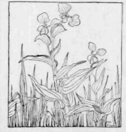
It's a Nice World.

"I do not know the reason for this but this is the way it has always been, and so I suppose it is all right."