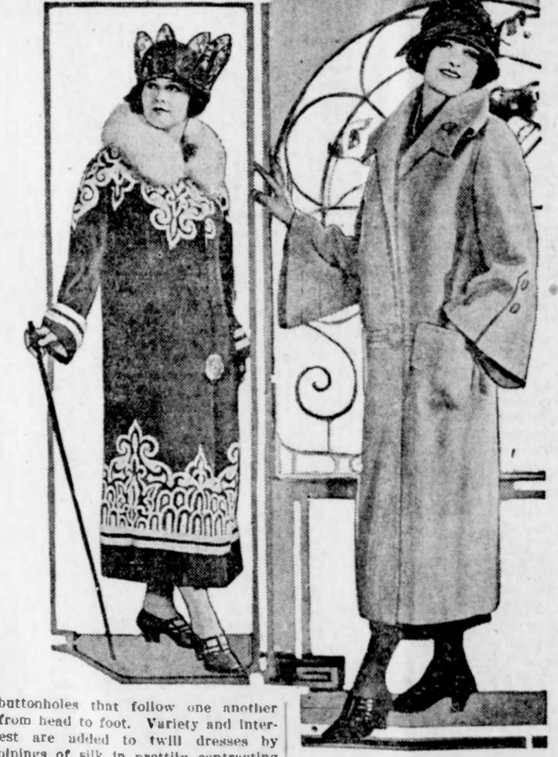
Summer Coats for General Wear.

Lace yokes and inserted panels of the same lace extending from yoke to hem are used with plain satin and with fowered in frocks that are usual to any afternoon occasion.