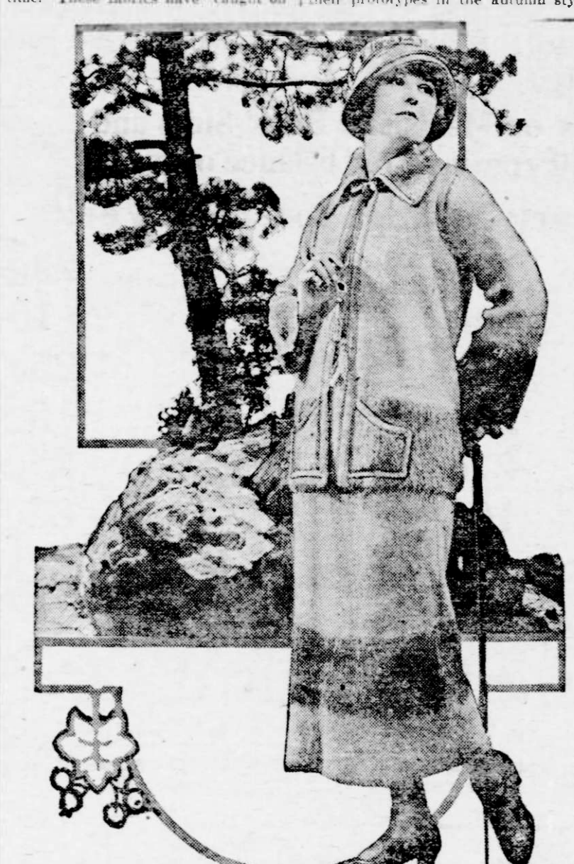
Sport Suit and Knitted Fabric.

THE lure of outdoors is never stronger than during the crisp days of autumn... for junior styles in millinery follow the modes for grownups to some degree.