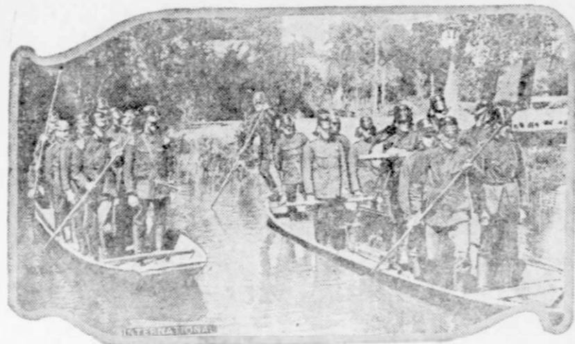
In the Spreewald, the Venice-like suburb of Berlin, are located handsome dwellings and estates. To guard these properties from fire a special gondola corps has been formed by the Berlin fire department.